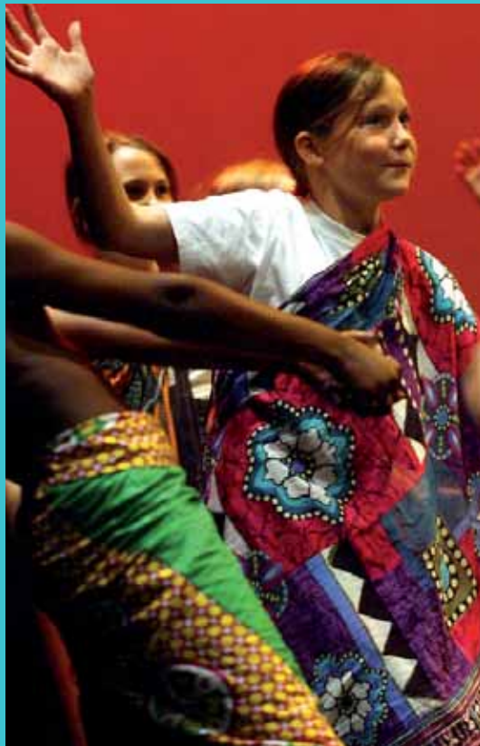
▶ All Saints C of E School performing their music with movement piece Salam Alekum at the South East Artsmark celebration event, June 2006.

We define learning outside the classroom as: