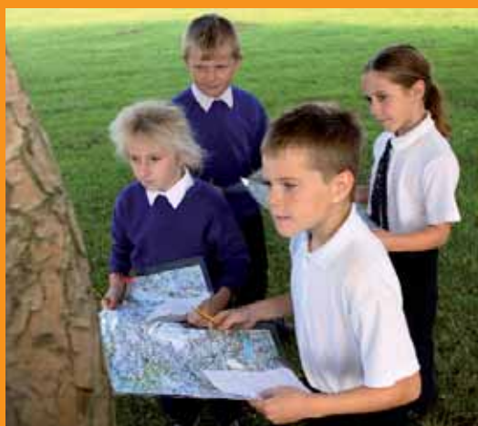
▶ Image provided by the Geographical Association, Action Plan for Geography

Encourage the use of 'safety badges', showing that external providers manage safety appropriately, so schools can use them without seeking more detailed assurances.